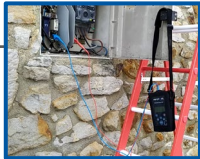
Line Device - Transmitter